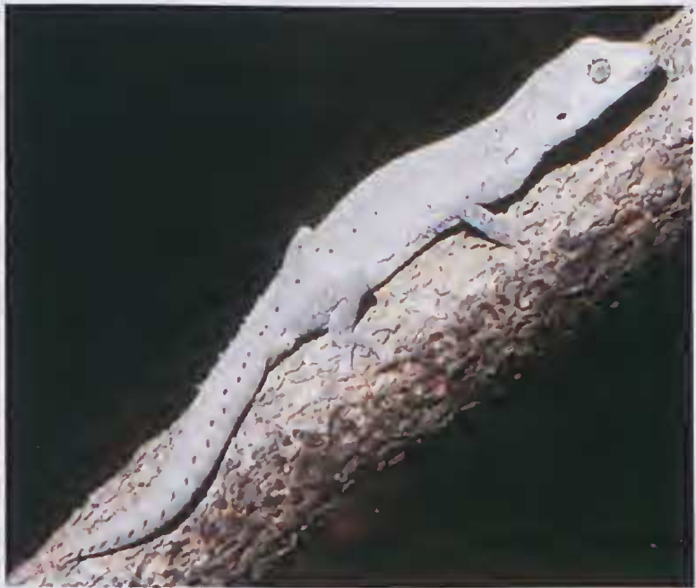
FIG. 3. Strophurus krisalys sp. nov. (AMSR143869) from near Winton, Qld.

29); snout length 40.0-45.6% of head length (=42.6%, n = 29).